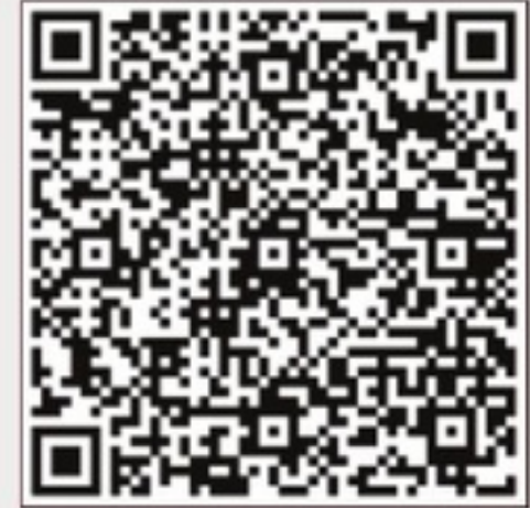
LOCATION QR CODE

More Hyper Mart, Decathlon Reliance Mart, Heritage